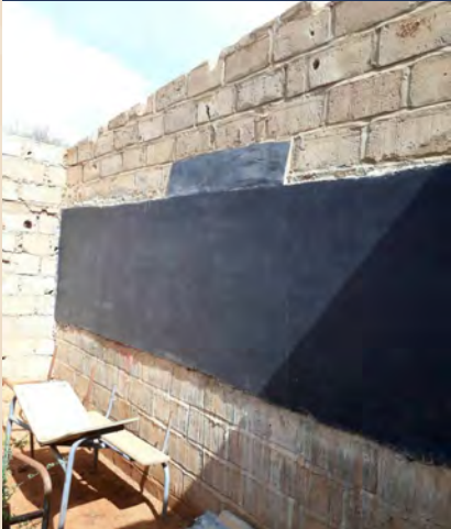
School without a roof in Senegal