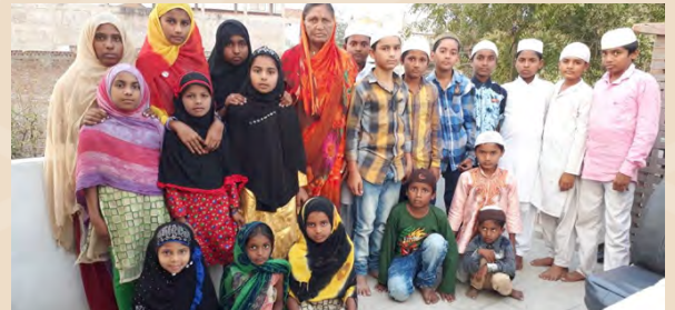
In India, we ardently support education and Qur'anic classes