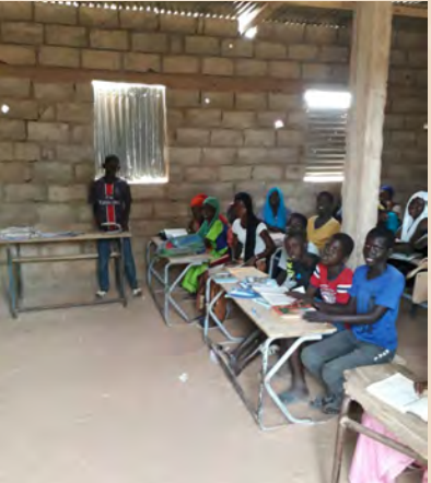
Senegalese students in their fully covered school