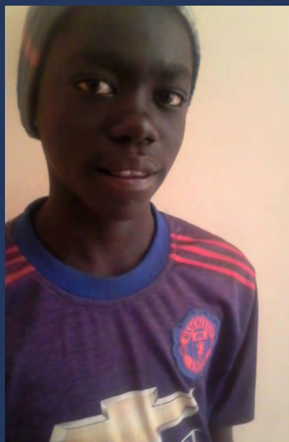
Meet one of 5 graduating Hafizh at the orphanage in Senegal. MashaAllah!

These orphans in Tivaouane, Senegal receive their weekly food supply. AH ensured that they have meals and clothing so that they can focus on their studies. Prior to our support, they were seen rummaging through garbage for food & clothing. They spend their time memorizing Qur'an with AH two full-time, paid teachers. They beamed with enthusiasm when they received soap, oil, and lotion that they never had before.