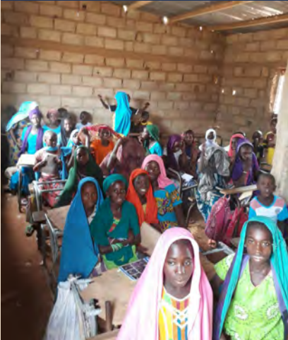
AH constructed a new roof

One of the most efficacious ways to evade a never-ending cycle of poverty is through education. As such, education is a core facet of AH work. When children attend school, they become literate and undaunted: they dream of pursuing a complete education and imagine a more promising life. Many orphans and poor children end their schooling to work, which prevents them from furthering their careers. With little income, it is difficult to work their way out of hardship, and so the cycle continues. AH is committed to funding admission fees, transportation costs, clothing, and school supplies for students in need. We also ensure the learning environments are secure so that the students can bloom successfully.