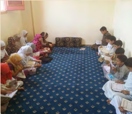
Al-Hakim School in Egypt

One of the most efficacious ways to evade a never-ending cycle of poverty is through education. As such, education is a core facet of AH work. When children attend school, they become literate and undaunted: they dream of pursuing a complete education and imagine a more promising life. Many orphans and poor children end their schooling to work, which prevents them from furthering their careers. With little income, it is difficult to work their way out of hardship, and so the cycle continues. AH is committed to funding admission fees, transportation costs, clothing, and school supplies for students in need. We also ensure the learning environments are secure so that the students can bloom successfully.