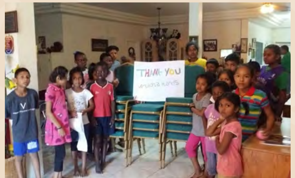
New chairs purchased for God Bless the Children Orphanage in Guyana