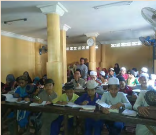
Madrasah in Cambodia