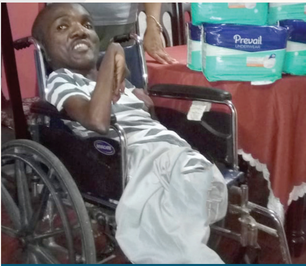
Monthly Distribution of Diapers to the Elderly & Handicapped in Guyana.

AH Medical Aid has been covering costs for its recipients' medical needs such as surgeries, medications, medical supplies and co-payments for doctors' visits. AH Medical Assistance has reached the shores of USA, Guyana, Bangladesh, Senegal, Cambodia and other countries wherever AH assistance is needed. Be a part of this blessed service to fulfill the care for the ailing ones.