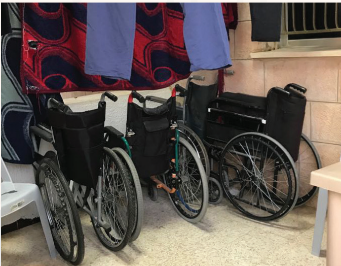
A Family With Four Handicapped Children.

Our NY volunteer visited a family with four handicapped children. It was distressing to witness four wheel chairs parked in their living room. The parents are struggling to sustain the expenses to care for their handicapped children. So, on a monthly basis, AH is funding the costs of diapers, clothing and other necessities. We are confident that you will continue to assist us to meet our monthly commitment to this family.