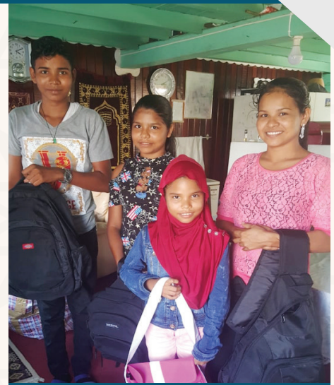
School Supplies Distribution.

Oh! How fulfilling it is to be taught and given the opportunity to succeed! The first revelation was on reading and knowledge, which therefore makes it an obligation to support the preservation of knowledge for all; poor or rich. Education remains a core function of AH operations. Both academic and Islamic education has been our priority. Students in Cambodia were funded to finish their college education. Blind students were recipients to our education funding in order to further their studies. Academic projects were funded in Africa, India, Bangladesh, Guyana, Gambia, Guinea, and other countries.