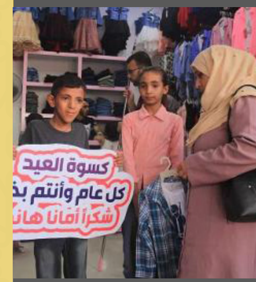
Your Zakaah gave the Orphans in Palestine the honor to shop for their own Eid clothing.