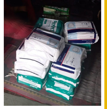
Visiting the sick and delivering supply of diapers.

Living in poverty and being stricken with illness can be devastating and leading to more distress. The poor has to wait months before they can be seen by a doctor. In the meanwhile, the illness worsens. AH screens all the medical request with doctors' verifications. In Guyana, AH pays for dialysis treatments, medications and eye glasses. We have a supply of walkers, wheel chairs and crutches ready to distribute when needed. We established a Monthly Diaper Project for the elderly, disabled and accident victims. The diapers are donated and shipped from New York. In Senegal, Bangladesh and Morocco AH paid for minor surgeries and medications. For example, in Morocco, AH takes care of a single parent mother who is blind with an autistic daughter. In USA, AH pays the copayments for medications and other minor health related expenses.