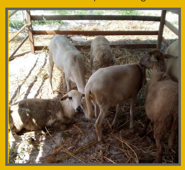
In Guyana AH purchased these sheep for an unemployed brother to start his own business.

"And He found you in need and then made you need-free" (93:8) AH Micro Economic Project aims to elevate from despair into self-sufficiency by giving the less fortunate the opportunity to become financially independent. We provide the tools and finances to enable them to achieve their entrepreneurial goals.