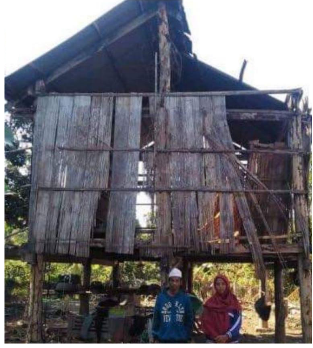
Living conditions of Grocery Hamper Recipients