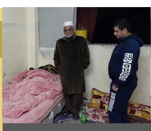
Delivering a winter blanket to a sick youth in Ramala

In Palestine, more than 70 blankets were purchased to deliver in Gaza and to donate to Orphan families in Ramallah. There were two families where the fathers and husbands had died leaving several children between the ages of 6 and 13. Monthly donations for these families were left with a contact who ensures that the welfare of widows and families are taken care of. This humble brother also used the funds from AH to provide Iftaar for about 100 children in Ramallah and Gaza. In addition to these contributions, AH husband and wife volunteer team did Udhiyah/Qurbani in Jordan and ensured that all the people on the list for monthly stipends received meat for Eid-Ul-Adha. Some families said that they had not eaten meat since the previous year when the couple was there and performed Qurbani for AH. On the day before Eid, our volunteers purchased flour, rice, soap, oil, tomato paste, lentil, salt, sugar, flour, and tea bags to distribute to 25 families. Alhamdulillah, the families were able to have a celebratory feast in recognition of one of our two Islamic holidays. May Allah accept the tireless work from AH volunteers and the altruistic contributions of all our donors. Aameen.