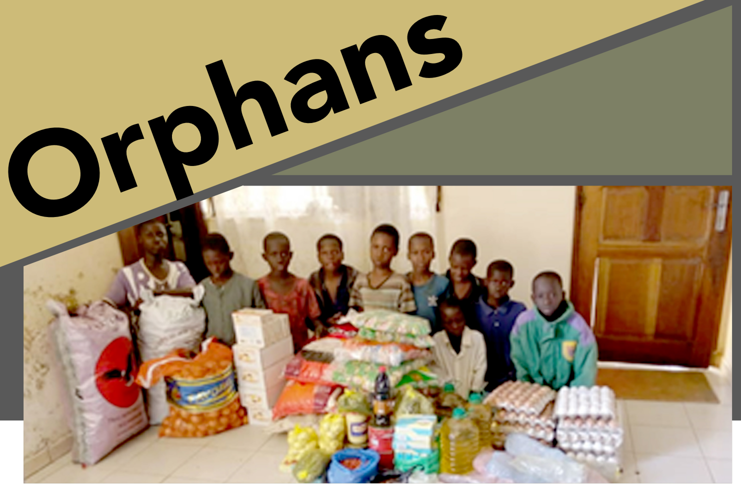
Alhamdulillah with your Zakaah, AH provides food, clothing and education for Orphans in Guyana, Cambodia, Bangladesh, Senegal, Burma, Haiti, Morocco and Kenya. Sponsor an Orphan/Child for $30. Per month.