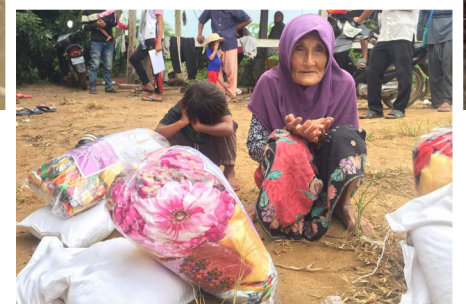
Glorifying Allah for your kindness.

child at a loss until a persistent AH volunteer lent a trusting (amaana) hand to navigate her situation. With integrity and anticipation, this determined volunteer reached out to the local Islamic Institution. Alhamdulillah, they responded eagerly by providing a laptop to the child and bringing some