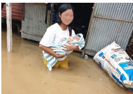
This young woman carries her infant though waist-deep water.