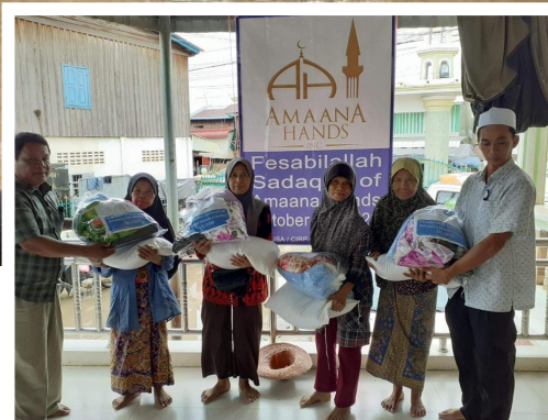
Over 150 families received relief packages of tents, mosquito nets, blankets, and dry food.