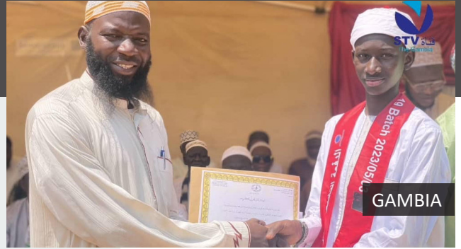
Your sponsorship aided this student for six years of studies to become a Hafiz of Qur'an. The sponsorship covered his dorming and educational expenses. Your Zakaah will continue to pay the way for his pursuit of higher studies.