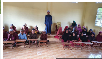
Your Zakaah have supported daily Qur'an memorization classes for both boys and girls. This is a blessed Sadaqah Jariyah.